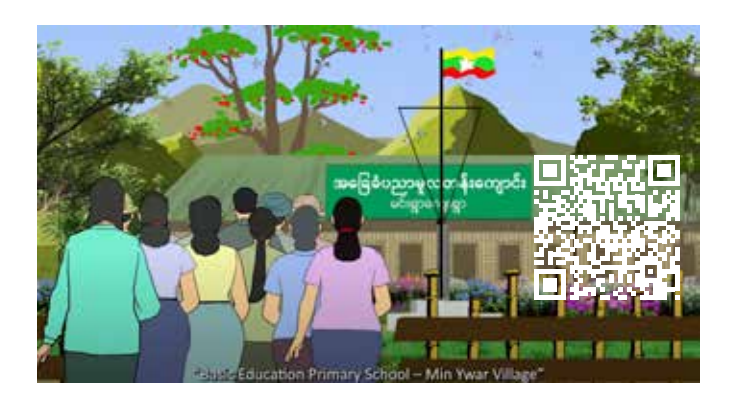
Several animated videos on legal identity were created in Burmese, in sign language and with English subtitles, with vivid examples to explain how the lack of identity documentation deprives people of any basic access to health, education, justice and freedom of movement among other rights.

has been a real asset to sustain engagement, reorienting the local to global strategy onto grassroots community-based capacity building activities. Materials were developed and rolled-out for rights' awareness and participatory advocacy approaches. As an example, animated videos on legal identity were tailored in Burmese and in sign language with vivid examples to explain how the lack of identity documentation deprives people of any