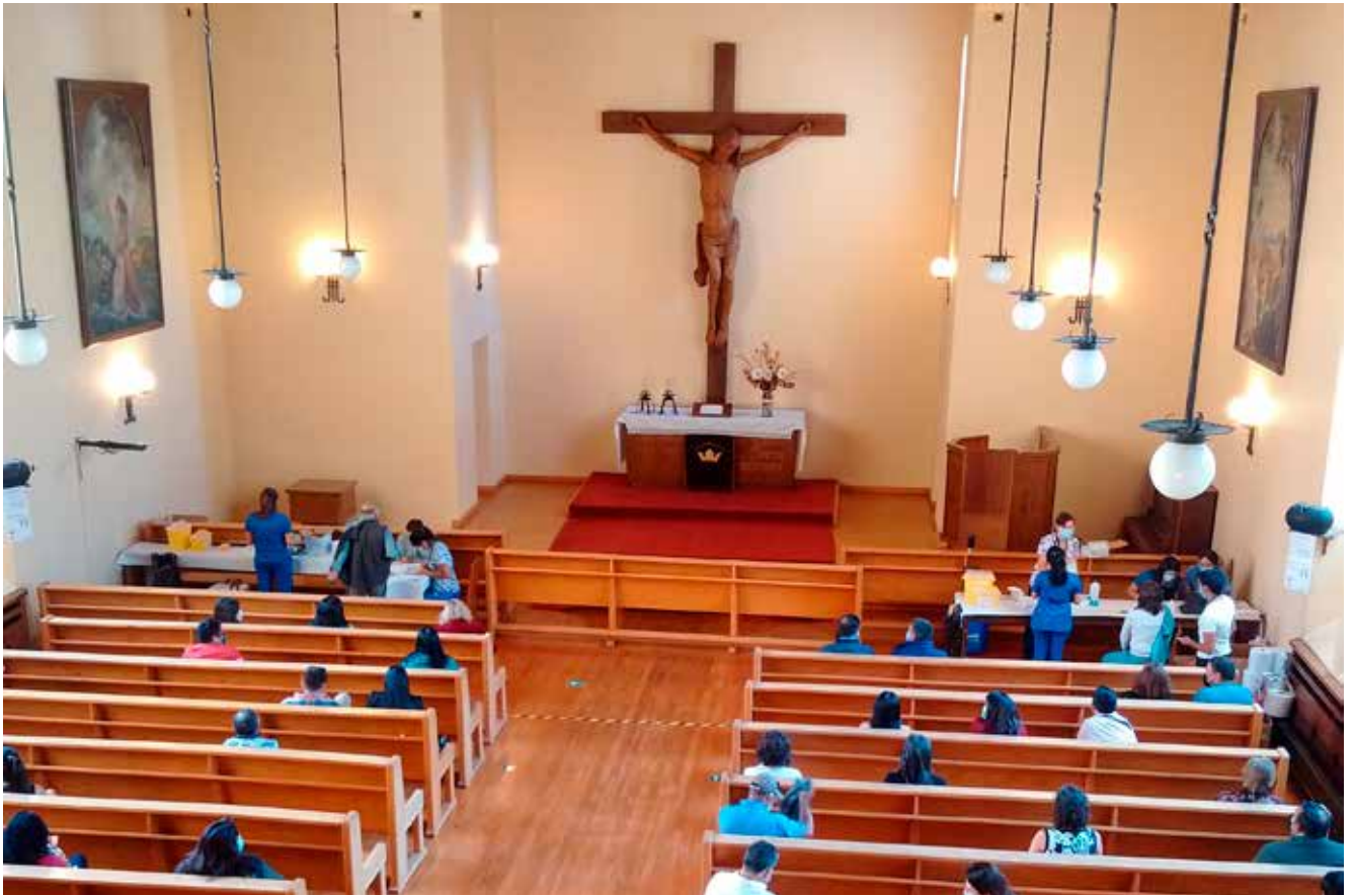
Many spiritual practices and faith actors' organizations have been changed by the pandemic.