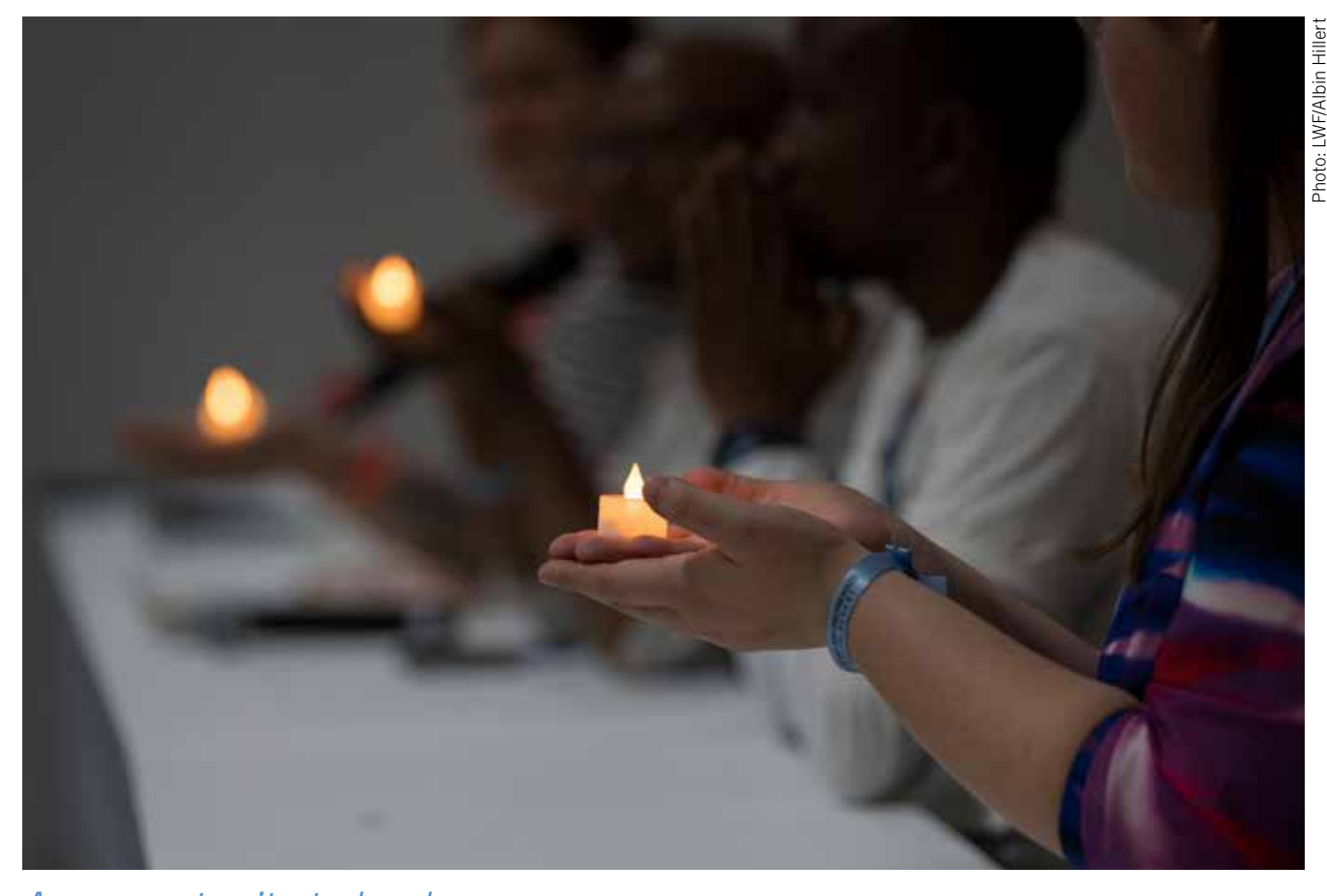
An opportunity to lead people in accepting the plurality and diversity of voices by building dialogue and creating safe spaces.

Another international FBO interviewee explained that faith actors have not always been very good at changing "the narrative that's being constructed by religious fundamentalists" and recognizing their value in fighting it. This is linked to another more general