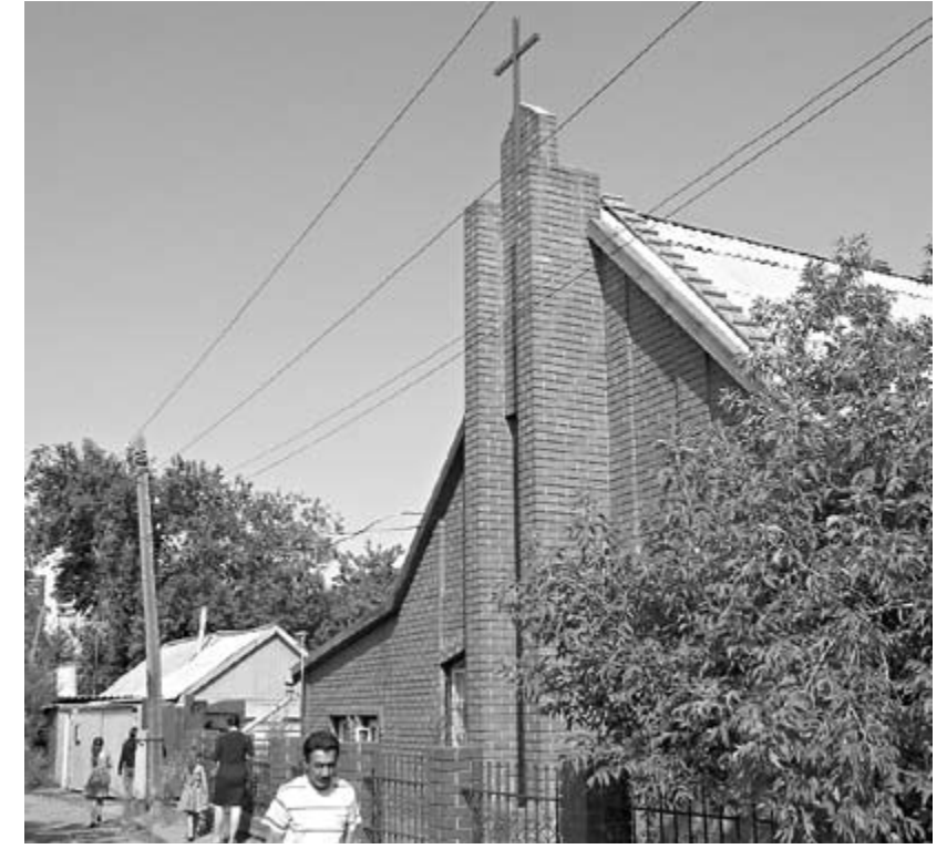
Because of the massive emigration to Germany, worship attendance has dwindled in the Astana Lutheran congregation, Kazakhstan.

How you remained true to the Word. Many would not have coped, and yet you survived. You have demonstrated to the world that the Church belonging to Jesus Christ can carry on."