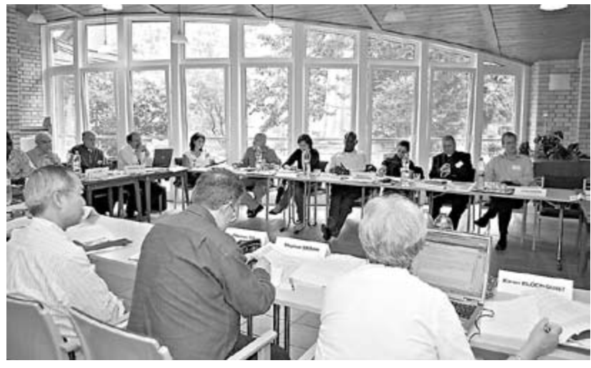
Around 30 persons from European and non-European LWF member churches participated in the LWF consultation in late June in Budapest, Hungary.