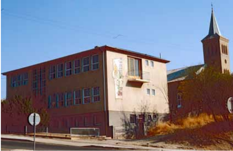
ELCRN headquarters, Windhoek.

(5,200 members), formerly known as the German Evangelical Lutheran Church in South West Africa (DELKSWA), is rooted in the central and southern parts of Namibia. Its worship services are primarily in German. The ELCIN–GELC grew out of the Rhenish Missionary Society and later the Evangelical Church in Germany (EKD), whose workers ministered to the German-speaking community. Its first synod was in 1926 and it became an independent church in 1960 and a member of the LWF in 1963.