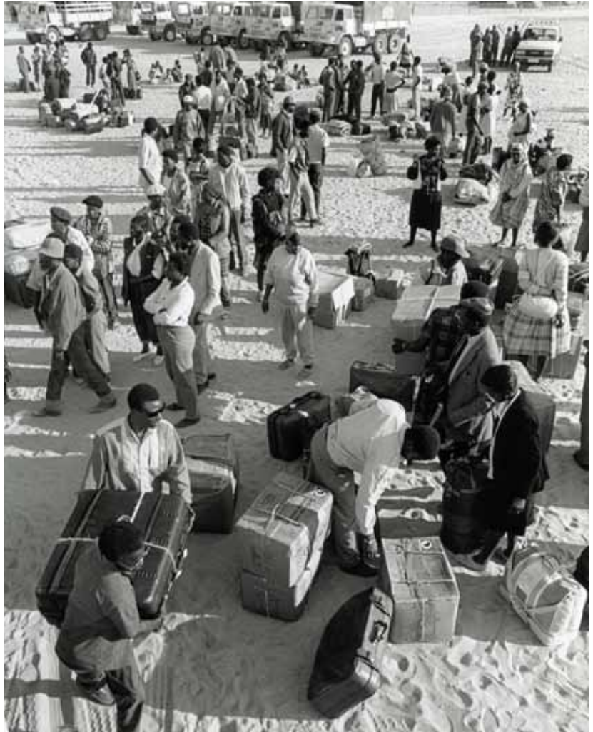
Returning refugees, 1989.

Small numbers of Namibian refugees began to arrive in Tanzania in the early 1960s, including the President of SWAPO, Sam Nujoma. By the mid-1970s, the largest numbers of Namibian refugees (then a few thousand) were being hosted in Zambia. Zambia was also chosen as the site for the UN Institute for Namibia, which aimed to train Namibians to take up administration of their country when it became free. The LWF helped provide support for Namibian refugees in both countries, and later