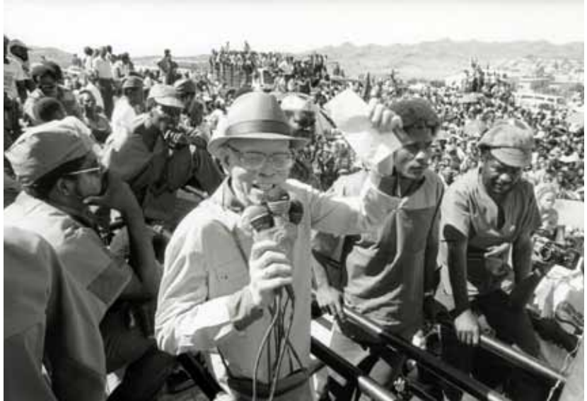
Rev. Zephania Kameeta at pro-independence rally, 1989.

Lutherans worldwide stood by the Namibians. In 1973, the US churches set up the Lutheran Office for World Community to represent the Lutherans at the United Nations in New York. From the beginning its top priority was advocacy for Namibia. Lutherans in Finland, Norway, Germany, and North America set up Namibia solidarity groups. It was largely through the Lutherans that information about Namibia got out