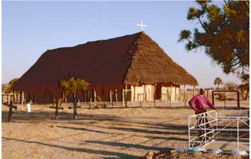
Olukonda Church (ELCIN), Northern Namibia.

The Evangelical Lutheran Church in the Republic of Namibia (ELCRN) (350,000 members) is the second-largest church in Namibia. Formerly known as the Evangelical Lutheran