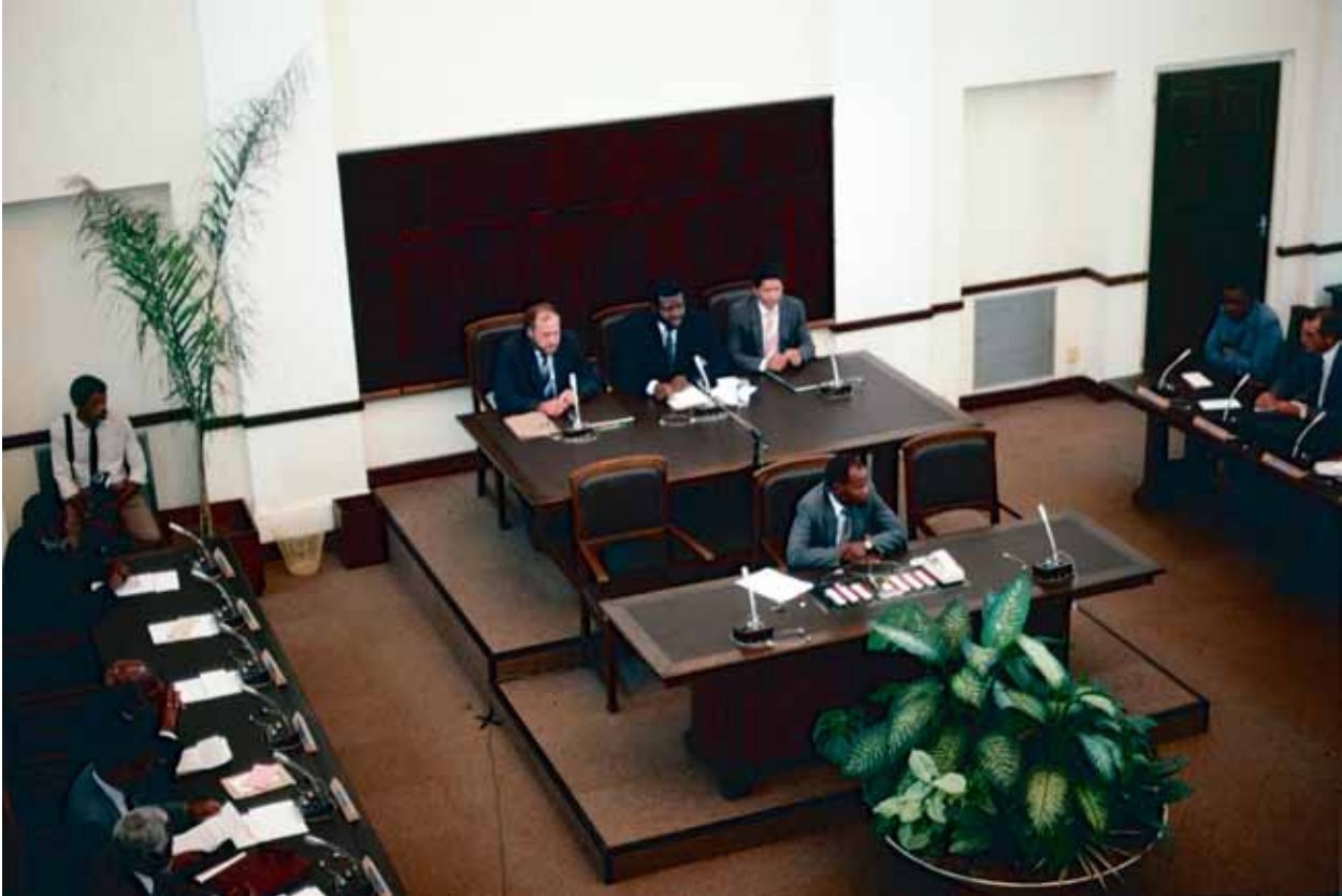
Constituent Assembly signing the Constitution of Namibia, Windhoek, 16 March 1990.