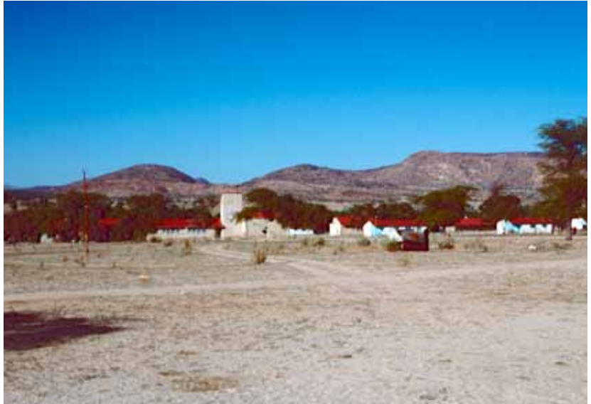
Former site of the Paulinum Lutheran Seminary where the Open Letter was drafted.

The international legal conflict over Namibia culminated in an advisory opinion of the International Court of Justice (ICJ) in 1971: South Africa’s rule over Namibia was in violation of the mandate, South Africa’s continued presence in Namibia was a violation of international law and South Africa should withdraw immediately.