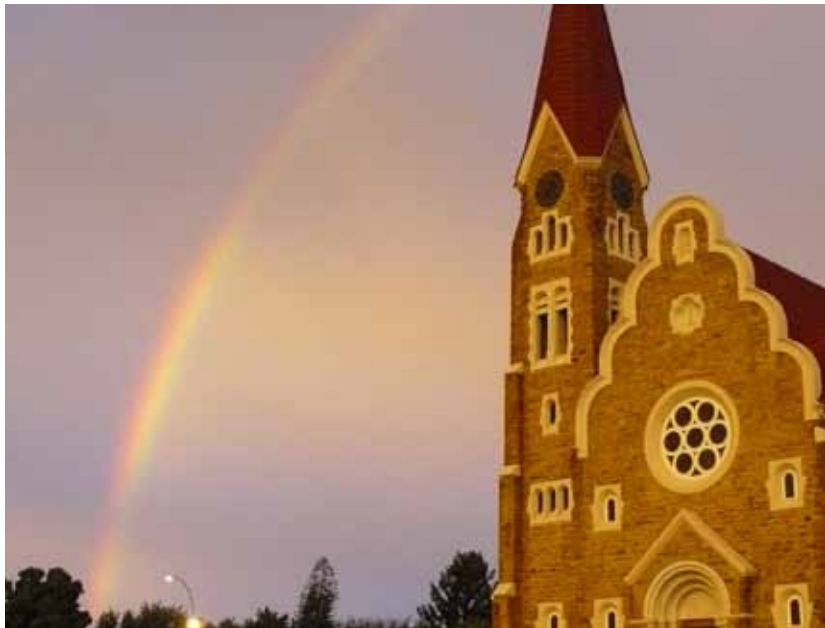
Christuskirche (ELCIN–GELC), Windhoek.

(5,200 members), formerly known as the German Evangelical Lutheran Church in South West Africa (DELKSWA), is rooted in the central and southern parts of Namibia. Its worship services are primarily in German. The ELCIN–GELC grew out of the Rhenish Missionary Society and later the Evangelical Church in Germany (EKD), whose workers ministered to the German-speaking community. Its first synod was in 1926 and it became an independent church in 1960 and a member of the LWF in 1963.