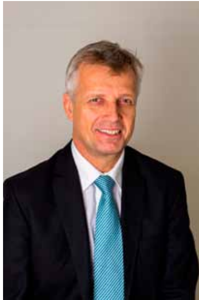
Rev. Dr. Martin Junge, General Secretary, The Lutheran World Federation.

This small booklet gives a flavor of the history and extent of that close relationship between the LWF and Namibia. The Namibian churches and the LWF played a vital role during Namibia’s struggle for independence. Under South African rule, the policy was to divide people along racial and tribal lines. The churches were virtually the only organizations that brought people together inside Namibia. It was largely through the church that black Namibians could have access to education, health