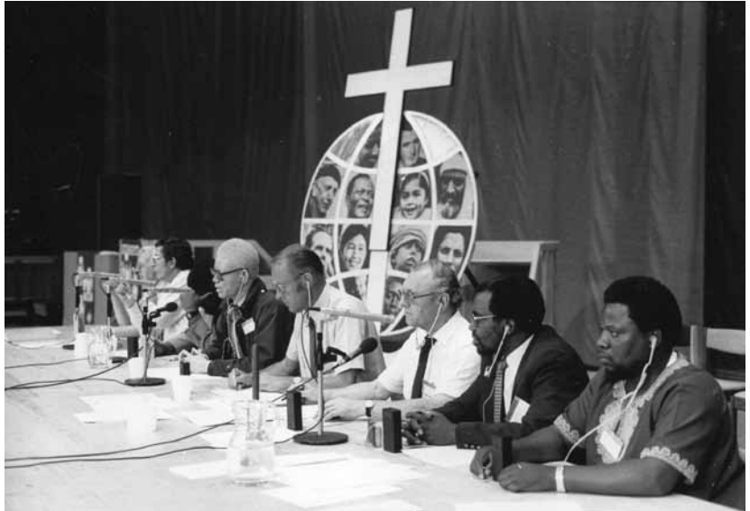
Open hearing on the suspension of white member churches in Southern Africa, Seventh Assembly of The Lutheran World Federation, Budapest, 1984.

By the time of the LWF Sixth Assembly, in 1977 in Dar es Salaam, it had become apparent that the