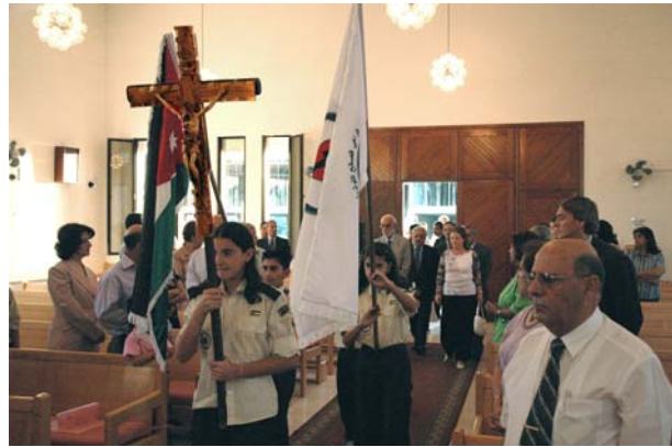
Photo: Evangelical Lutheran Church in Amman, Jordan. Amman Visit during LWF Council 2005.

Kanisatuk , the quarterly Arabic magazine of the Evangelical Lutheran Church in Jordan and the Holy Land, communicates news of the Lutheran communion and informs people about the work and the achievements of the church. The project fosters Christian evangelical awareness and strengthened Lutheran identity; promotes dialogue with other denominations and faiths; maintains contact with church members living abroad; and draws support for the work of the church.