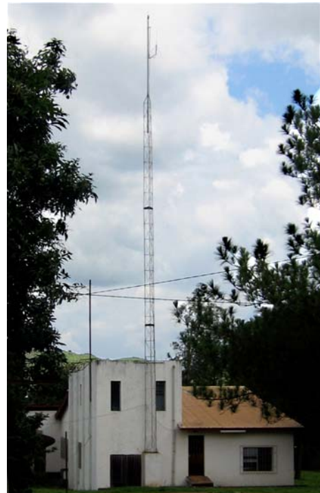
Photo: Sawtu Linjila radio antenna, Cameroon.

The Sawtu Linjila radio ministry of the Evangelical Lutheran Church of Cameroon brings the Gospel message in the Fulfulde language to an extensive population of Fulfulde, Fulani and Gbaya listeners. The strategy is to maximize transmission in Fulani speaking areas, develop the network of broadcasting partners, support radio listening with audio-visual aids, interact with the focus group to make relevant programs, and work in synergy with local churches and hospital chaplaincies. The radio ministry annually produces about 1,000 broadcasting programs comprising 17 types of program.